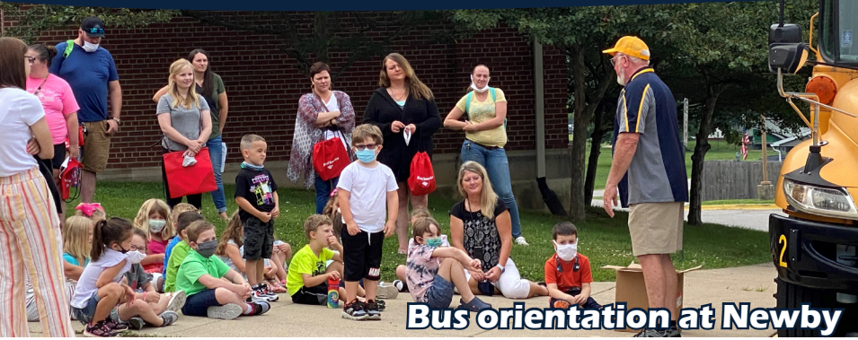
Bus orientation at Newby