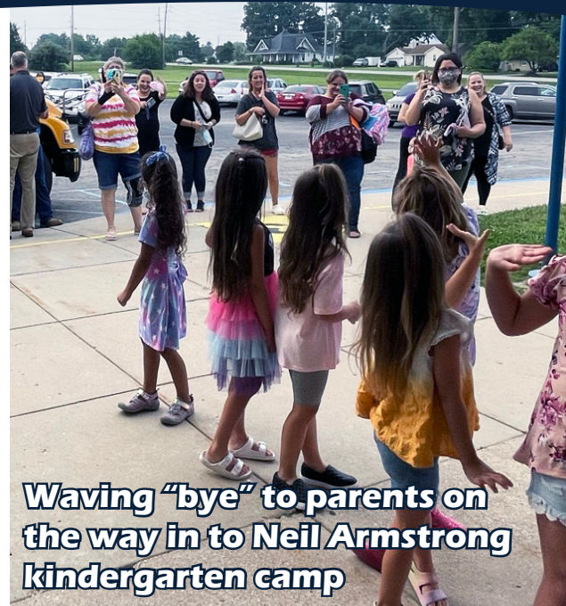
Waving "bye" to parents on the way in to Neil Armstrong kindergarten camp

In less than one week, students return to Mooreville Schools. We want to remind our families to check all of the information in this week's newsletters for back-to-school events, calendars, supply lists and more. School offices are open at this time. Please call during normal school hours with any questions which need to be answered before school starts.